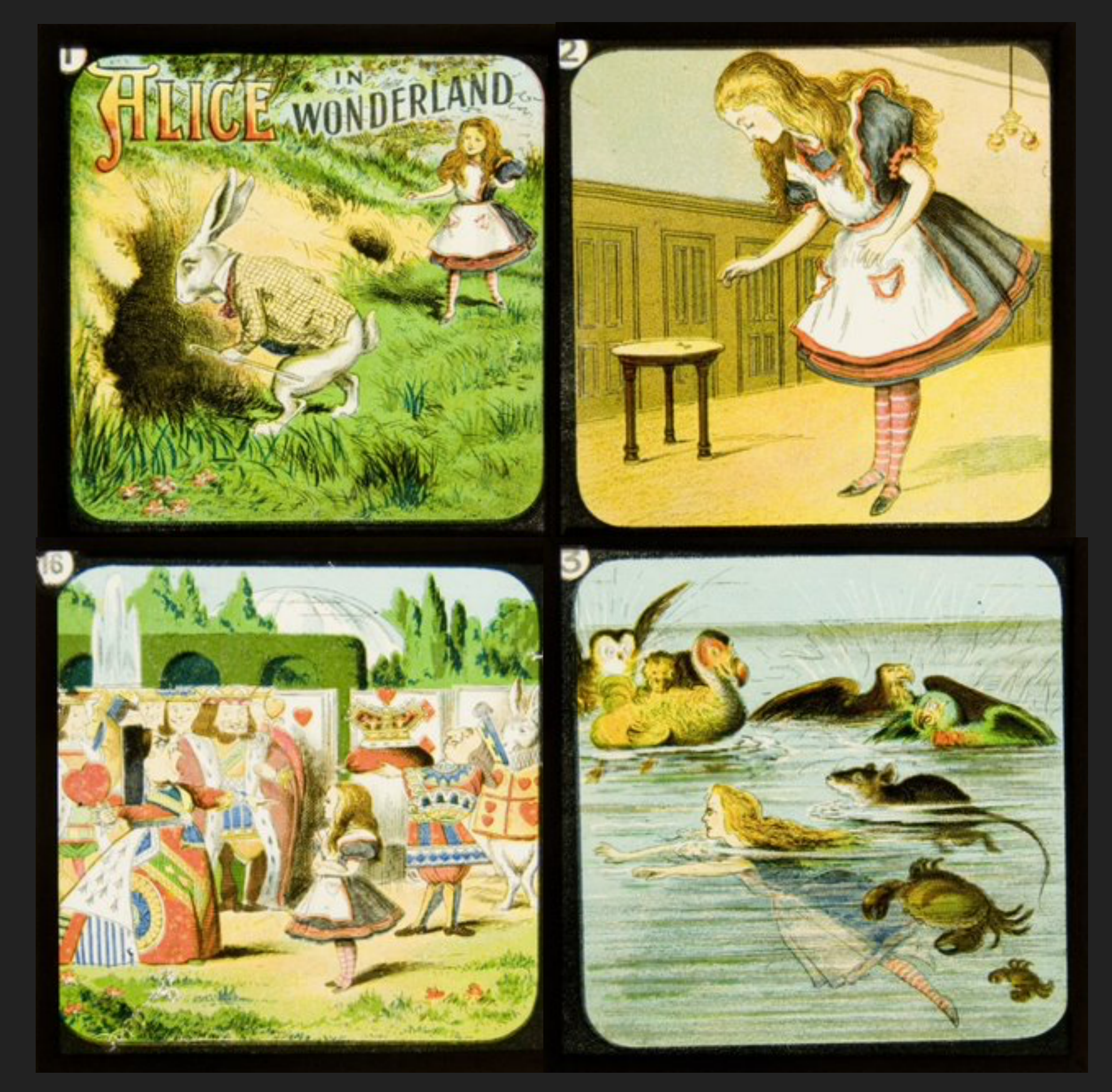
Magic Lantern Slides from the History of Science Museum , Oxford