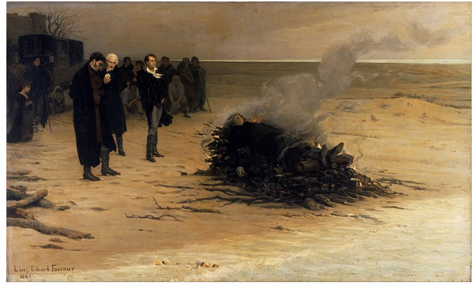
The Funeral of Shelley, by Louis Edouard Fournier, 1889.