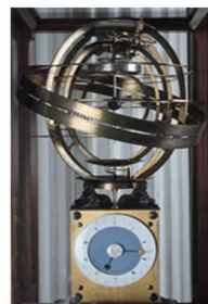
Revolutionary Clock With 10 hours on the face instead of 12. (Entrance Gallery)