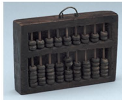
An Abacus Used for counting. (Top Gallery)