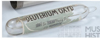
'Heavy Water' Used in science experiments. (Basement Gallery)