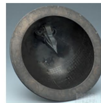
'Scaphe' Sundial For telling the time. (Top Gallery)