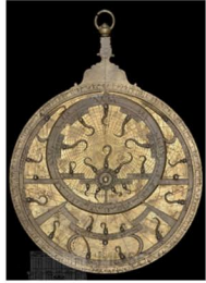
Astrolabe Used for telling the time and finding your way at sea (Entrance Gallery hint: it's in a case on the left of the fireplace.)

IN THIS MUSEUM THERE ARE OBJECTS FROM ALL OVER THE WORLD. CAN YOU FIND THESE 10 OBJECTS AND MATCH THEM TO THEIR COUNTRY? (LOOK AT THE LABELS NEXT TO THE OBJECTS TO FIND OUT WHERE THEY COME FROM.) WE HAVE DONE ONE FOR YOU. CHECK YOUR ANSWERS WITH YOUR TEACHER WHEN YOU HAVE FINISHED.