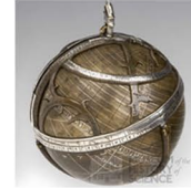
Spherical Astrolabe Used for telling the time and finding your way at sea. (Entrance Gallery)