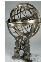
Armillary Sphere Used for studying the stars. (Top Gallery)