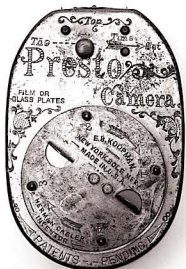
Pocket Camera For taking photos (Basement Gallery hint: this is low down in a side case.)