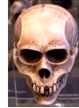
A Netsuke Skull Used as a button. (Entrance Gallery)